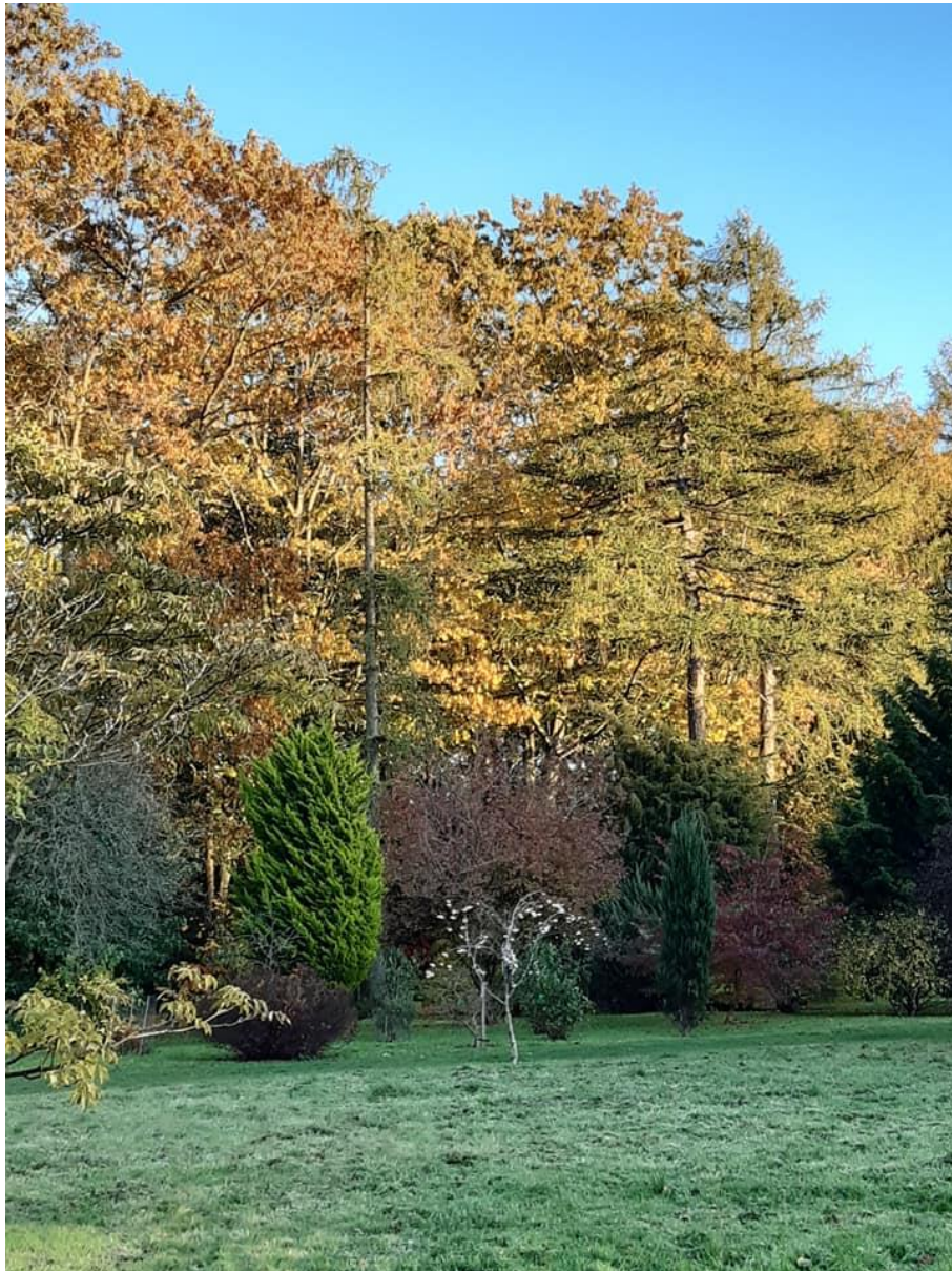
Autumn in Thorpe Perrow Arboretum