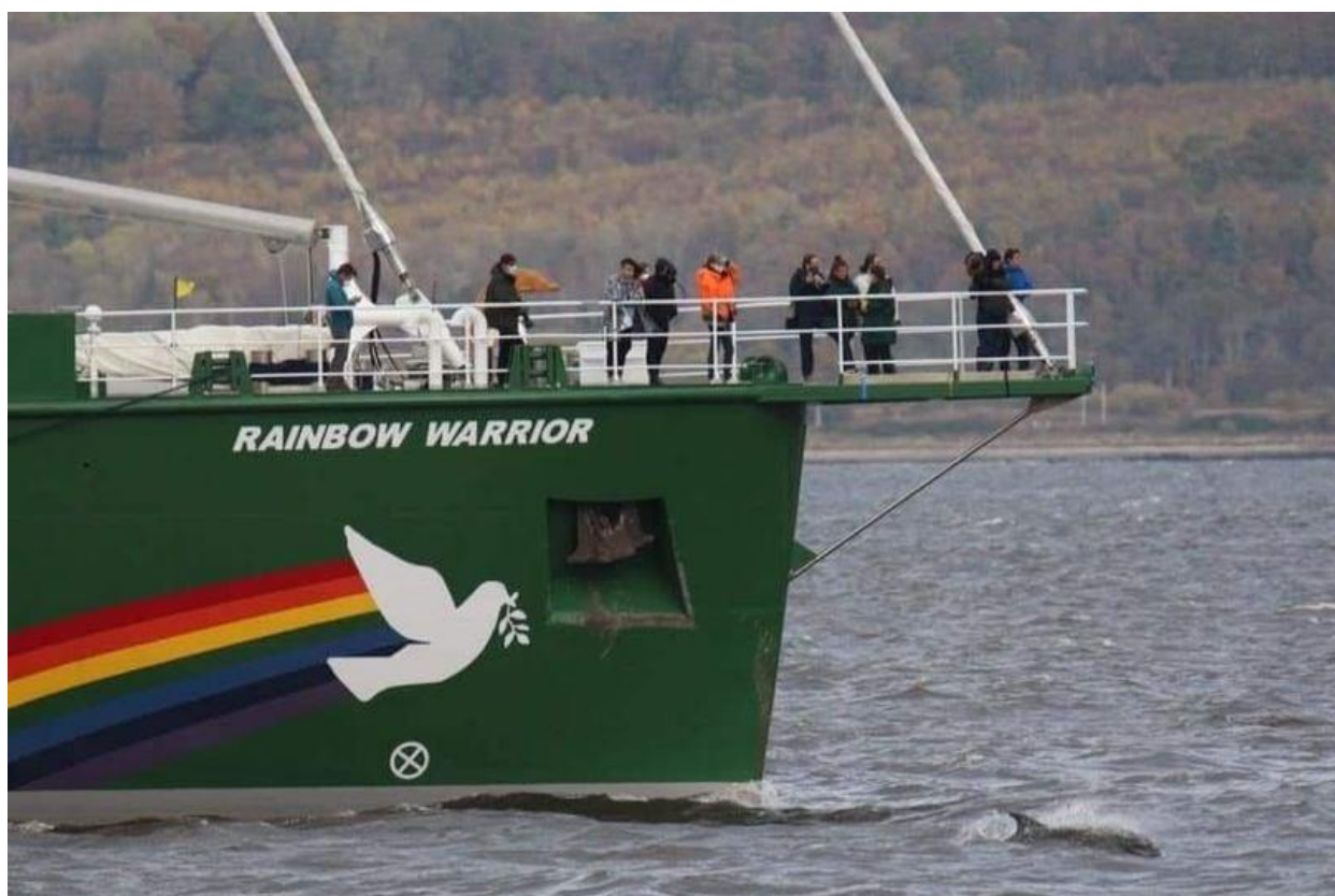
A wild dolphin leads Rainbow Warrior towards Glasgow

Quaker News, Views, Insights and Reports Issue 19 November/December 2021