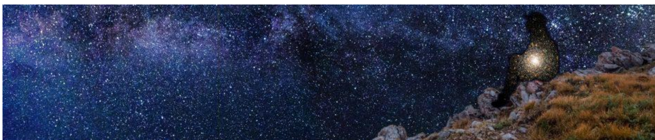
An African sky as shown on the website of Southern Africa Yearly Meeting